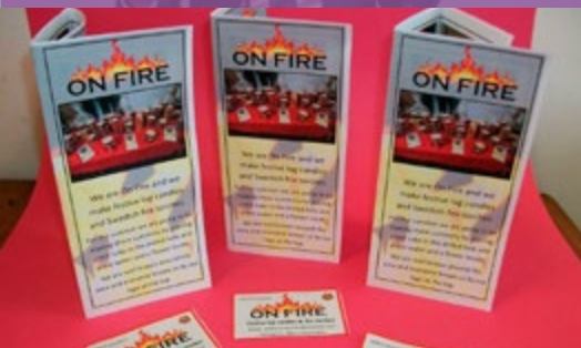
On Fire, Stocksbridge School