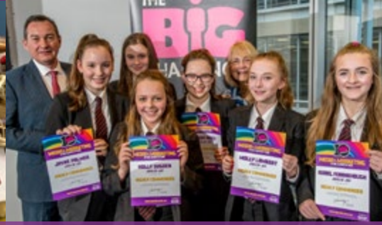
Jars of Joy, Forge Valley School