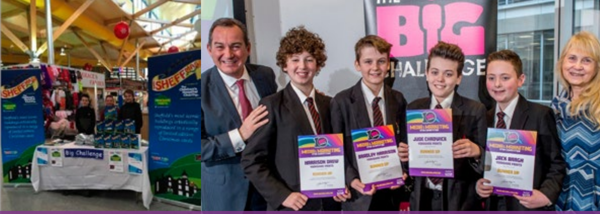
Yorkshire Prints, Forge Valley School