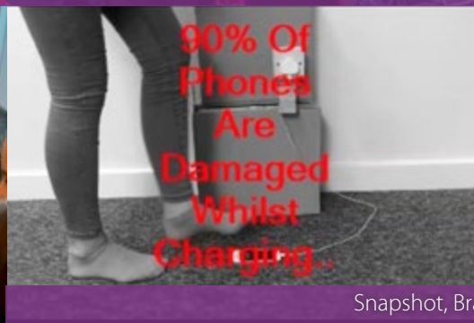
Snapshot, Bradfield School