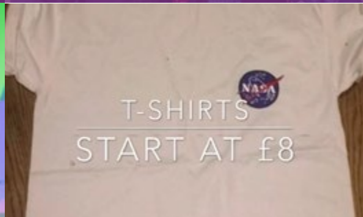
Oh My Tee, Sheffield High School